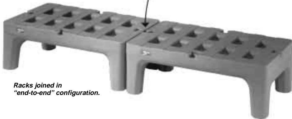
Racks joined in “end-to-end” configuration.