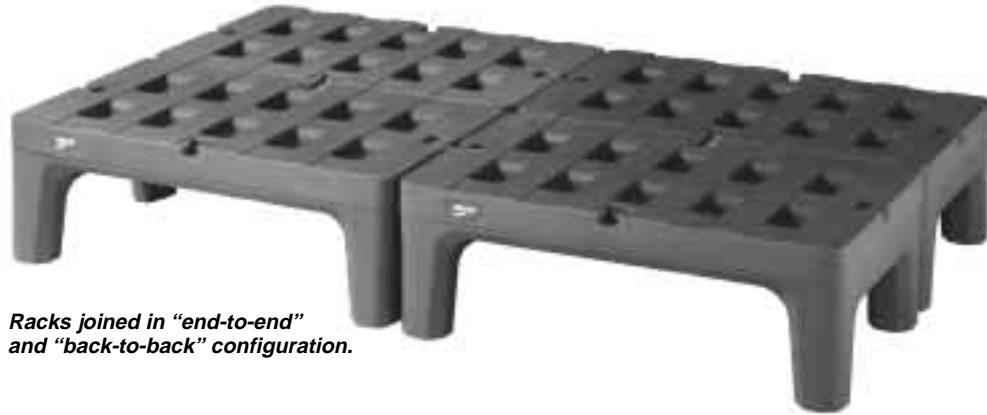
Racks joined in "end-to-end" and "back-to-back" configuration.